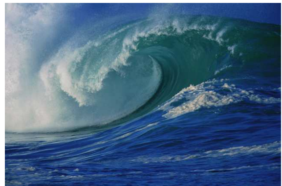
The Power of Water

AQ 2000 Soldermask AQ 2100 Legend Ink AQ 3000 Photoresist